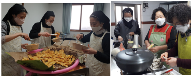
Junior sisters packing packed lunch

Meanwhile, on 27 January 2021 juniors at the priory house prepared packed lunch with pan-fried fish fillet and spicy stir-fried pork and donated them together with the quarantine supplies such as hand sanitizers and masks offered by sisters to ‘Donam-dong community center’ that cares for the elderly in need in the area.