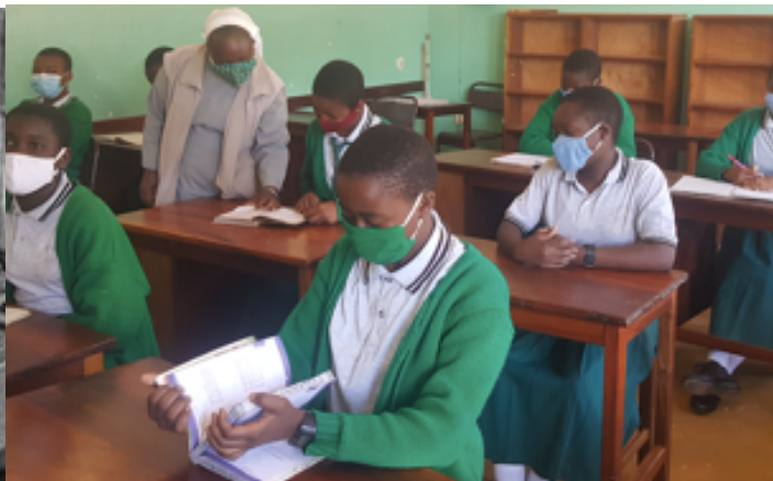
classroom teaching before/ classroom teaching now