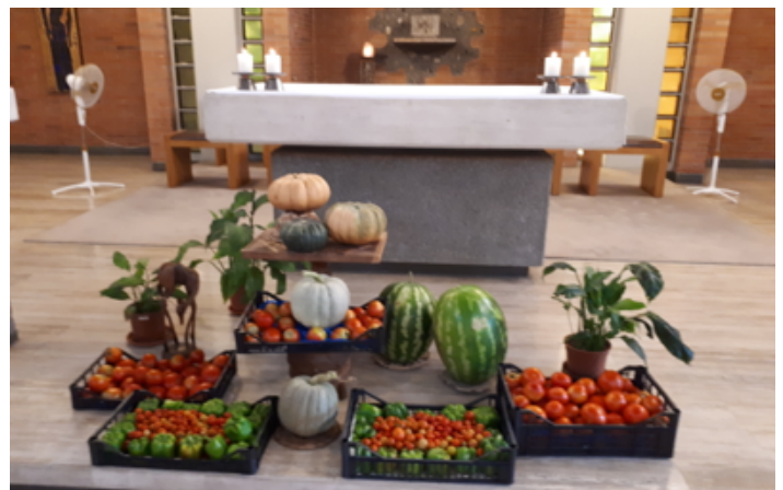
harvested fruits and vegetables offered at mass