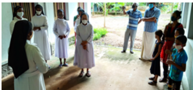
Sisters with some parents and children at the auditorium entrance

A special feature of the program was a video