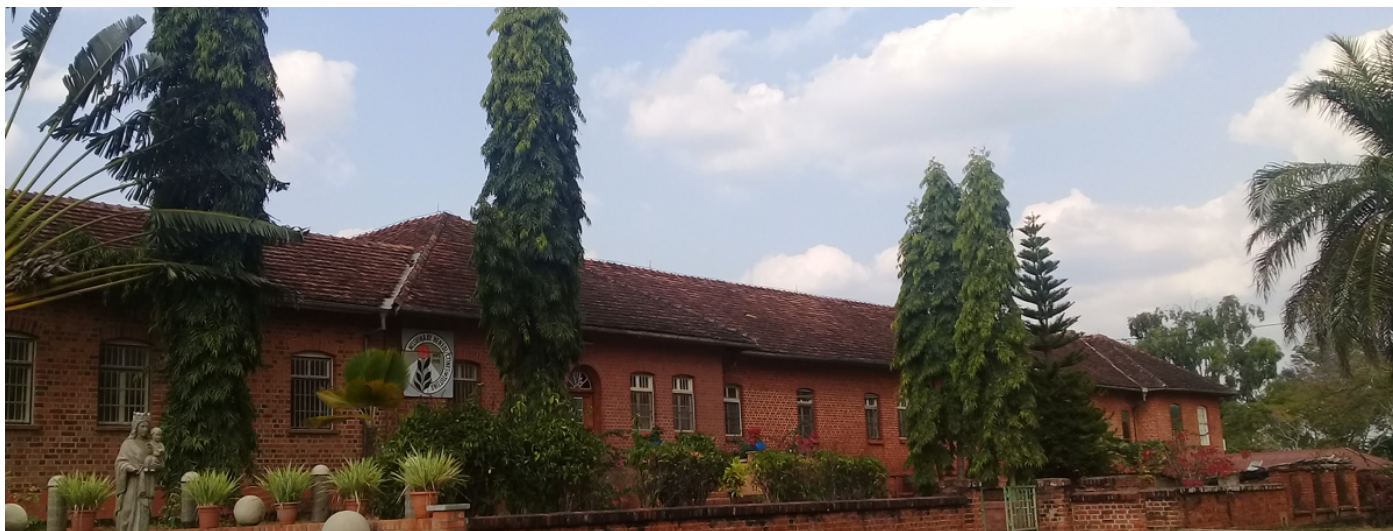
PERAMIHO PRIORY 2021

The unique, memorable and meaningful way of celebrating 120 years of our Peramiho Priory is the sisters' way of thanking God for His ever faithful love and mercy.