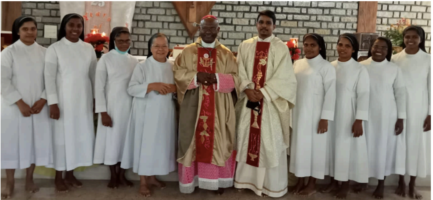
Launching of the Silver Jubilee of Missionary Benedictine Presence