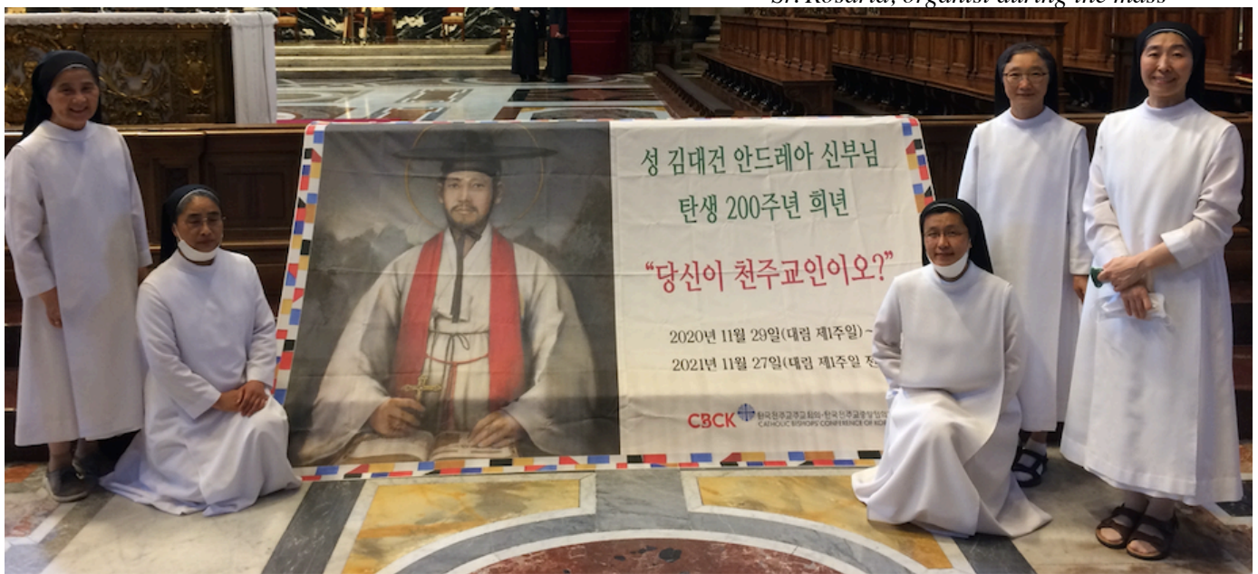
St. Andrew kim's portrait at St. Peter's Basilica