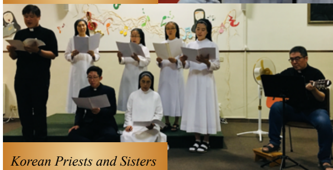
Korean Priests and Sisters