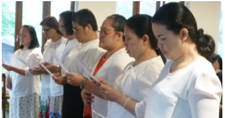
Oblates of Haus St. Benedikt

Haus St. Benedikt. The oblates renewed their oblation on July 11. at the sisters' chapel on July 11 Argentina. New oblates were accepted in Los Toldos and while oblates of Buenos Aires renewed their oblation earlier in April except for one who had her oblation on July 11.