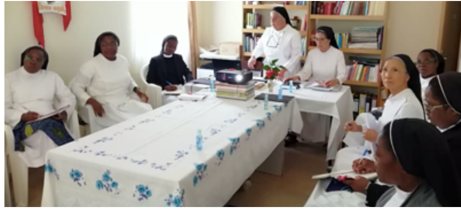
Workshop in Waku-Kungo