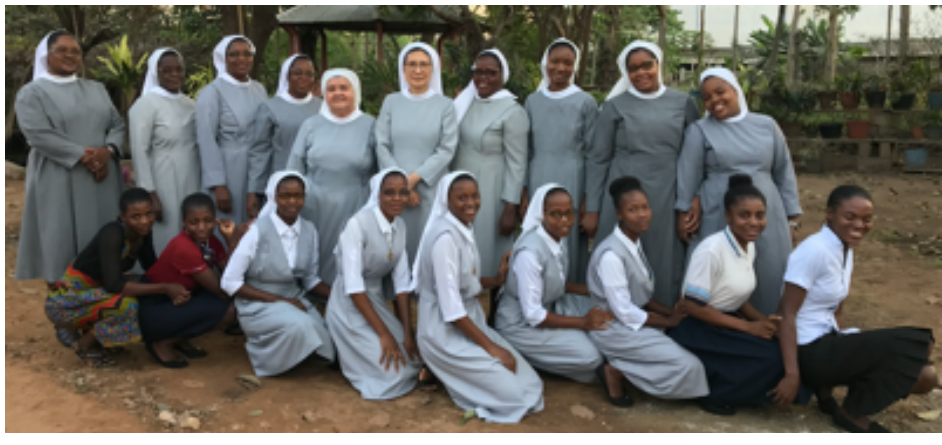
Kikolo Community and the Novitiate