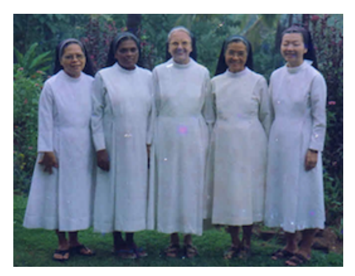
File photo of 1996: Pioneering Community of Shanti Nivas, Punalur

Once again, with grateful hearts, the sisters of Punalur thank all of you, far and near, who had been a part of Shanti Nivas, for your constant support. As we brave our way to the future, we take to heart Jesus' reassuring words: FEAR NOT, I WALK WITH YOU ALL THE WAY.