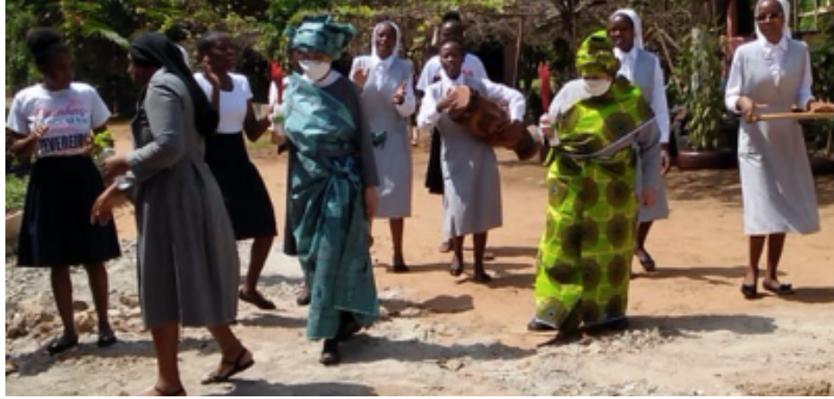
Welcome in Kikolo