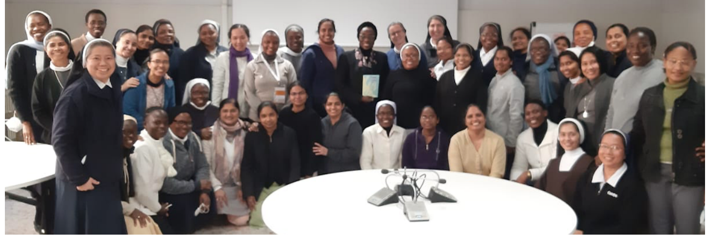
Participants of the UISG Formators' Formation Course