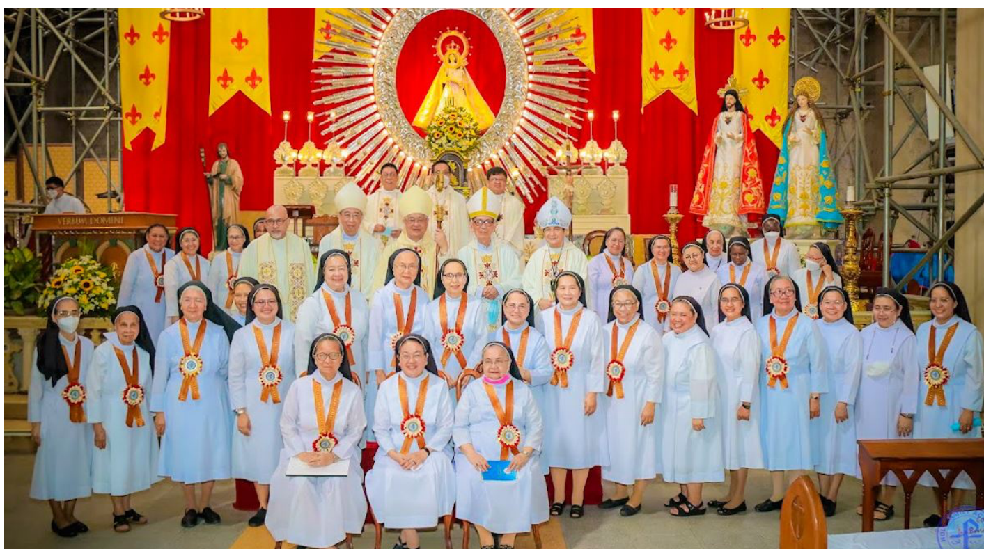
Bishops, Priests and Sisters from nearby stations joined the Angeles Community at the Holy Rosary Parish Church

“There are moments that the very things we (next page)