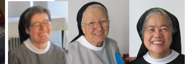
One smile at break time