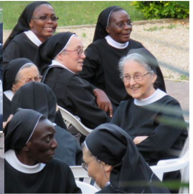
One heart at recreation