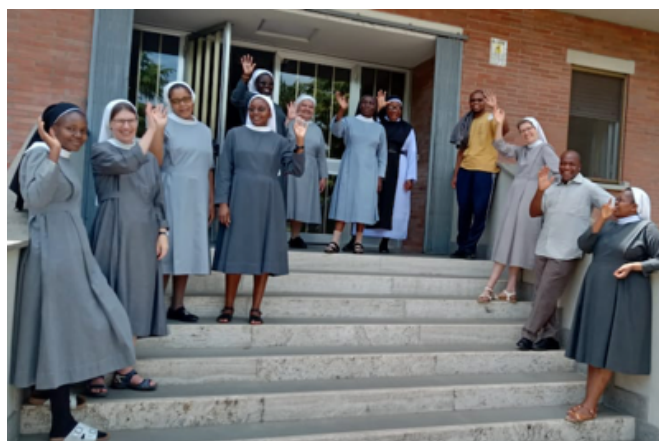
Bidding good-bye to MFP participants

On Saturday evening, after the Pentecost vigil, (next page)