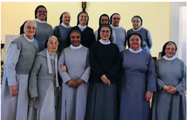
Araçoiaba da Serra