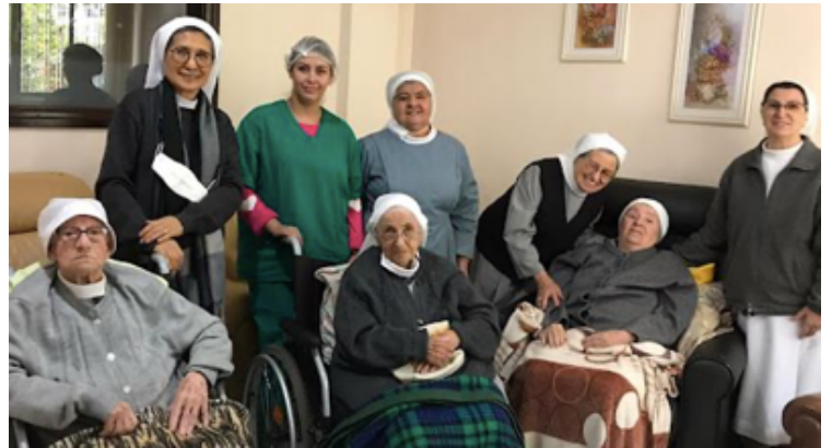
Priory House Infirmary