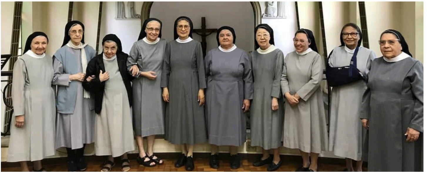
Rio de Janiero