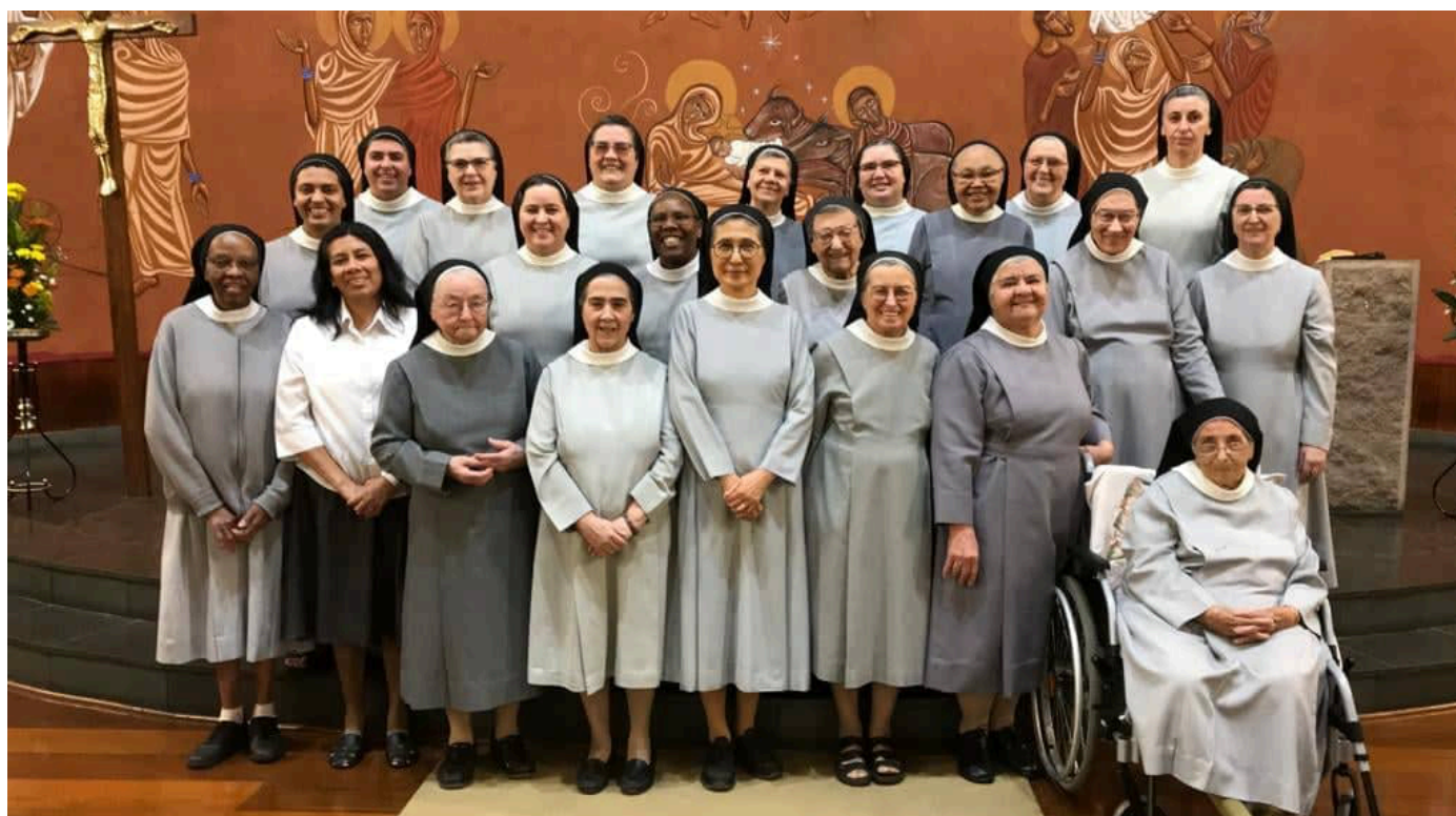
Sisters of the Sorocaba Priory House