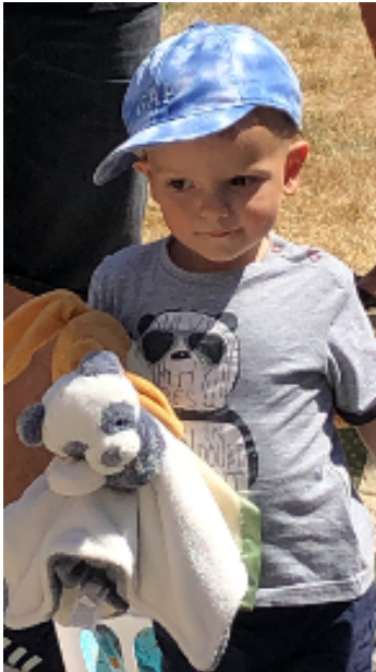
<---a Ukrainian child quickly claims gifts presented by the sponsoring family.

family of five: dad, mom and three children ranging in ages 6-13.