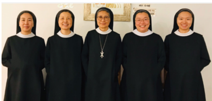
São Paulo – Korean Community