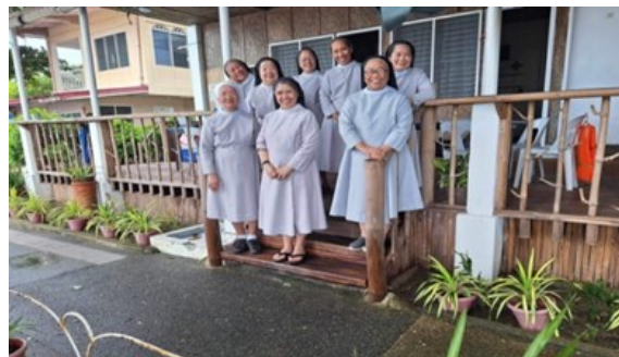
Manila Community @ San Fabian, Pangasinan- a Beach Resort

The following day we returned to Manila but we had Sunday Mass at our Lady of Victory Parish in Dau, Pampanga. It became an opportunity for vocation promotion.