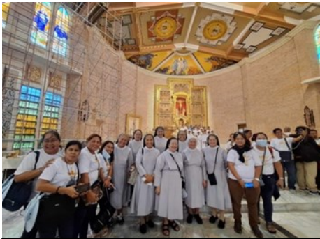
Manila Community with SSC Employees @ the St. John the Evangelist Cathedral in Dagupan