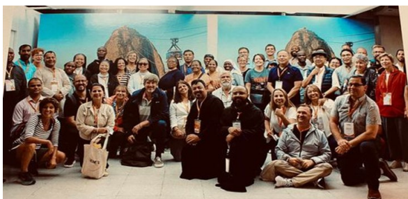
Sugar Loaf Group

Outings included Sugar Loaf Tour, Olympic Boulevard, Museum of Tomorrow, Historical Center, and Boat Tour – Laurindo Pitta. BENET concluded with Regional Meetings, and the next meeting is scheduled for Melk, Austria in 2026.