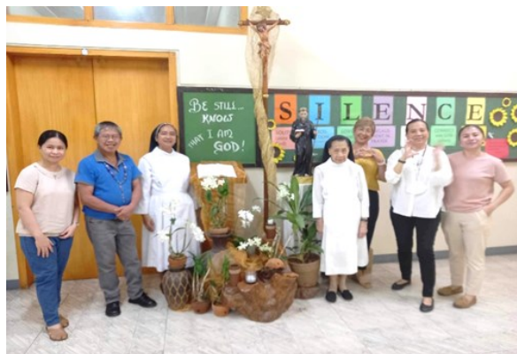
Resident and On-line Oblates of St. Benedict's