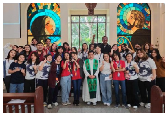
SSC-Manila Grade 12