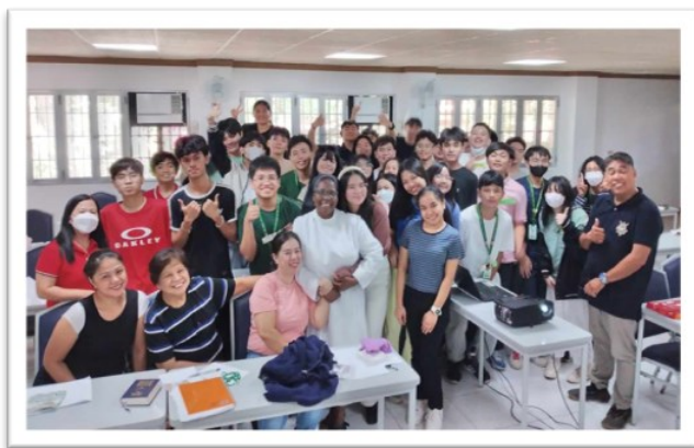
Retreat - St. Anthony Academy Grade 10

Thus, this 4th quarter was blessed for SSCS in every way – both in missionary vigor and in an economic plus.