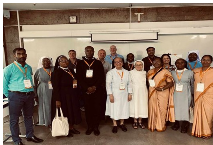
Workshop Group: German, Brazilian, American, Australian, Filipina, Chilean, Indian, South African, Tanzanian