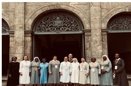
Participants: MBS of Tutzing from Brazil, Philippines, Uganda, Kenya and Tanzania