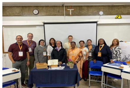
Lectio Divina Group: English, Spanish, Portuguese