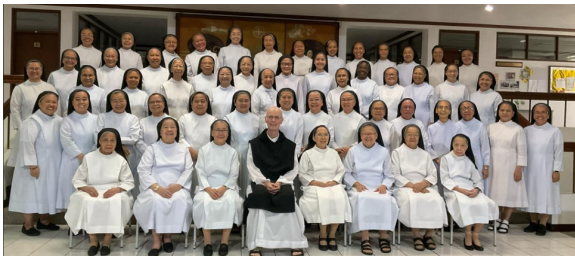
1st Cluster Retreat